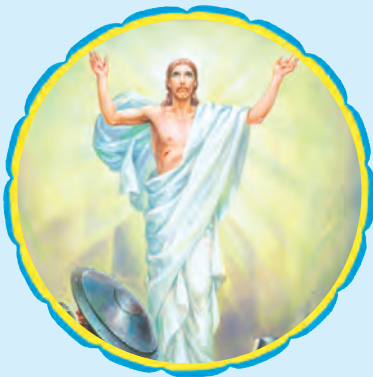
1. THE RESURRECTION For the virtue of faith.