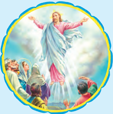
2. THE ASCENSION For the virtue of hope.