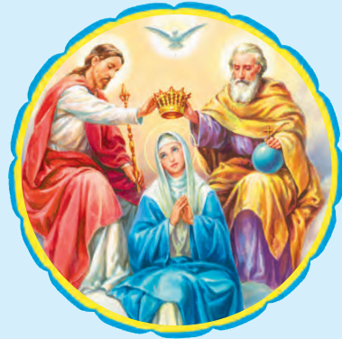
5. CROWNING OF THE B.V.M. For eternal happiness.