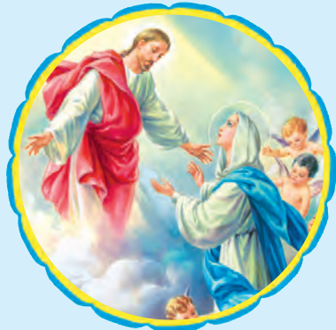
4. ASSUMPTION OF THE B.V.M. For devotion to Mary.