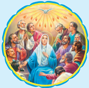
3. DESCENT OF THE HOLY SPIRIT For love of God.