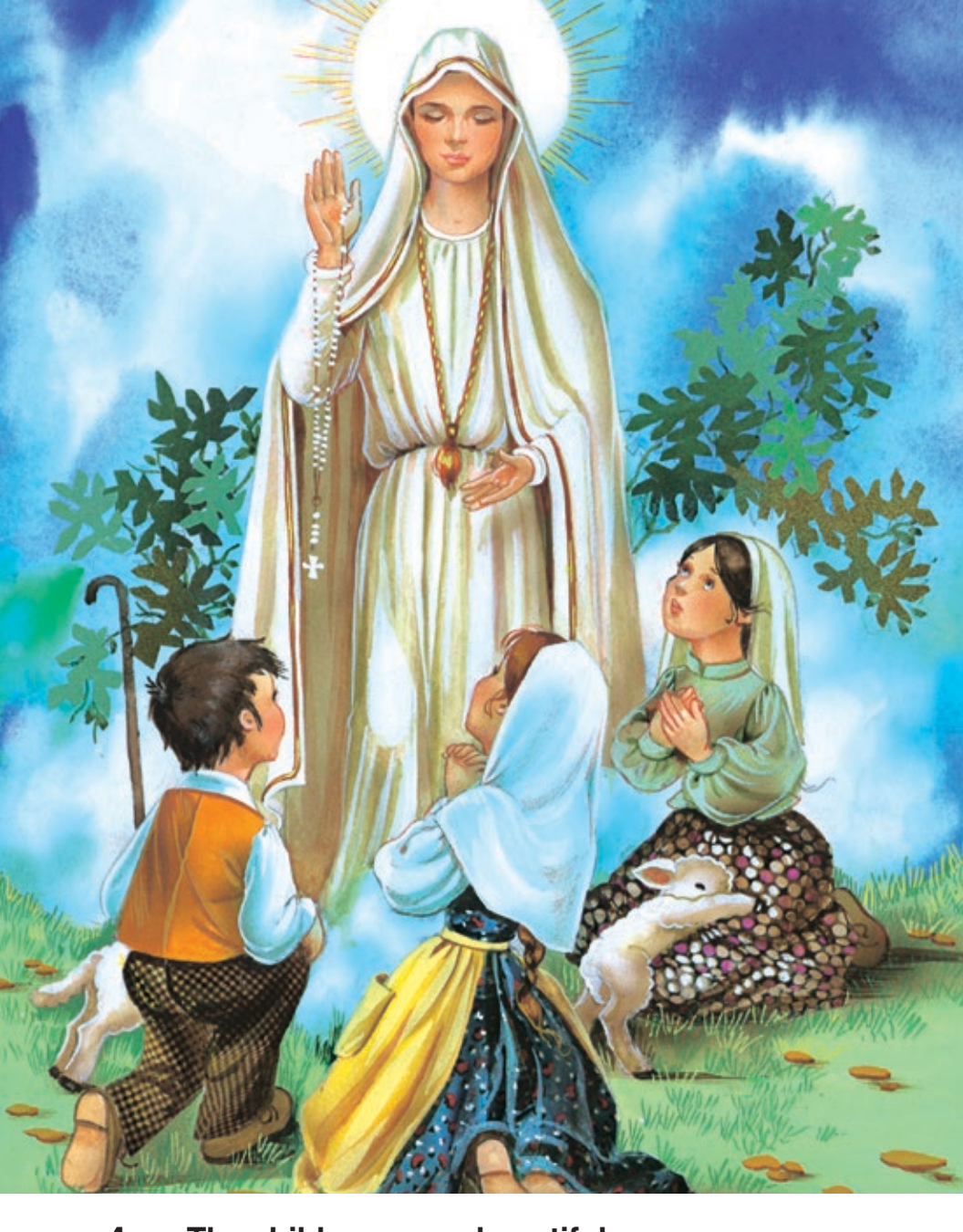
4 The children saw a beautiful young woman.