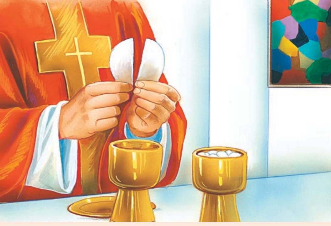
The priest breaks the bread in the Mass showing that we must all share in the one Body Who is Christ.