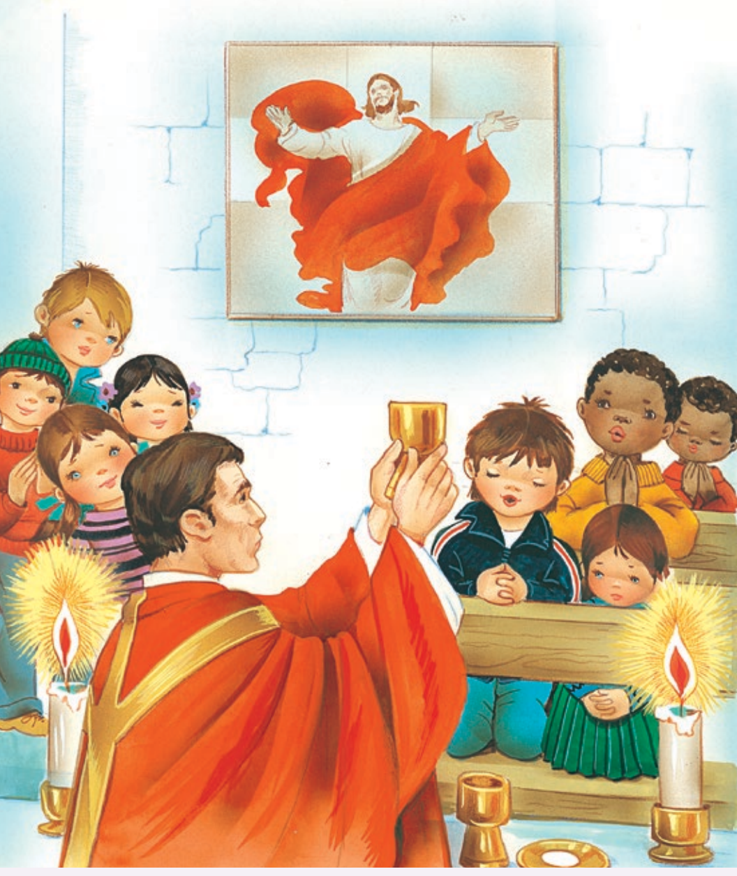
The priest changes the wine into the living Blood of Jesus. He uses the same words Jesus used at the Last Supper.