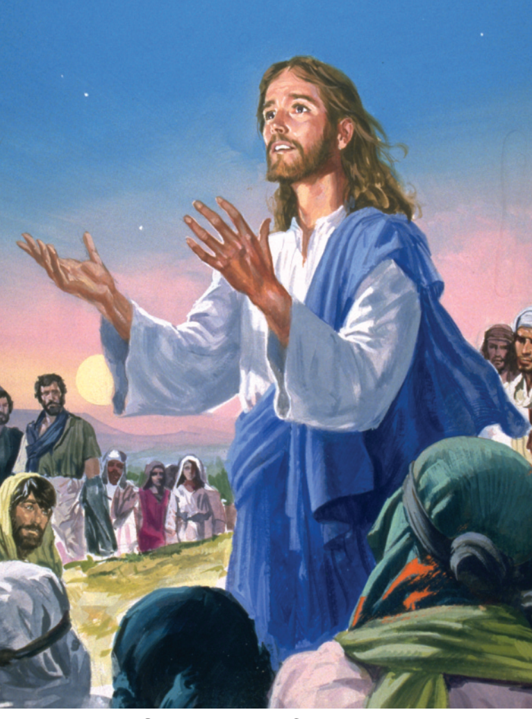
Jesus Speaks about God the Father