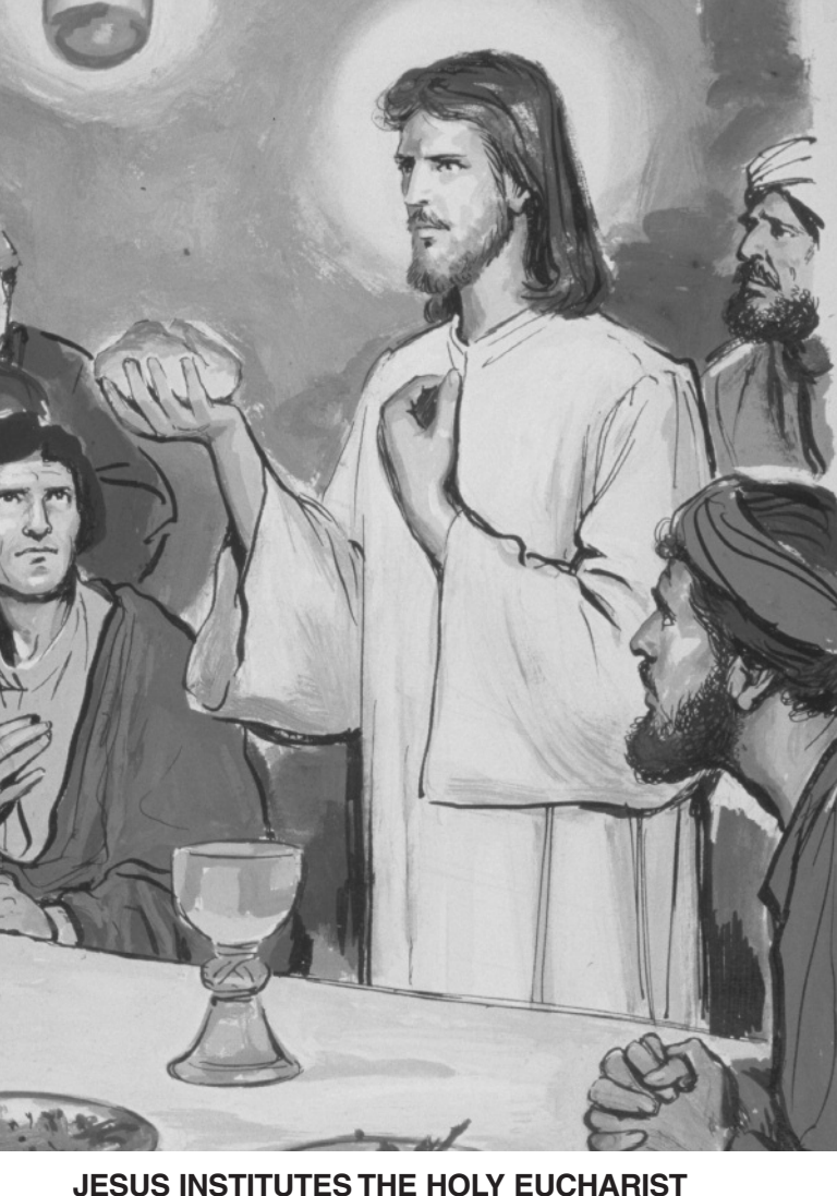
JESUS INSTITUTES THE HOLY EUCHARIST