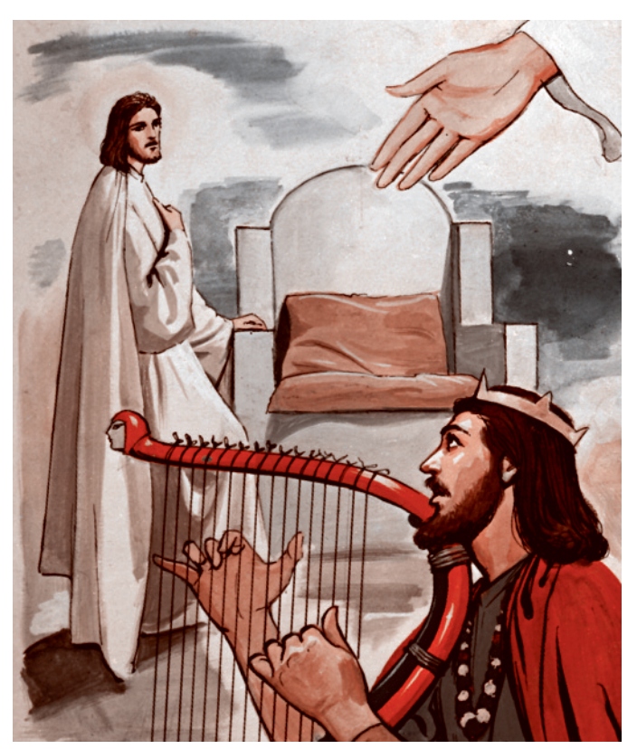
THE PSALMS — PRAYERBOOK OF THE HOLY SPIRIT

The Psalms may be looked upon as the prayerbook of the Holy Spirit. Over the long centuries of Israel's existence, the Spirit of God inspired the psalmists (typified by David) to compose magnificent prayers and hymns for every religious desire and need, mood and feeling. Thus, the psalms have great power to raise minds to God, to inspire devotion, to evoke gratitude in favorable times, and to bring consolation and strength in times of trial.