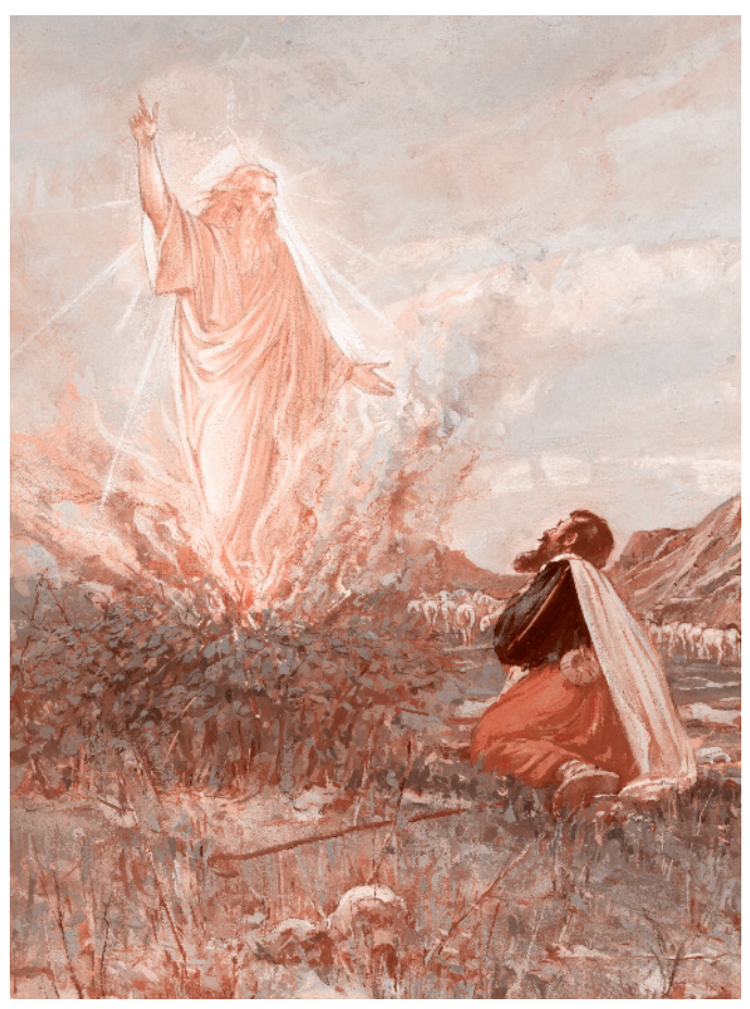
MOSES — POWERFUL EXEMPLAR OF PRAYER

The prayer life of the Israelites was typified by leaders such as Moses. By communing with God in the burning bush and on the holy mountain (for forty days and nights), he set an example of how the individual Israelites should pray to God.