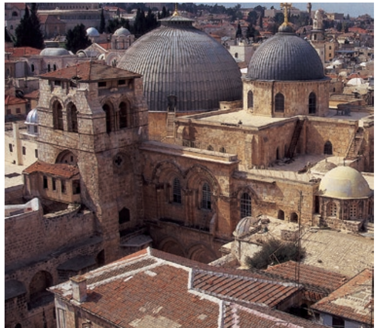
The domed roof of the Church of the Holy Sepulcher, Jerusalem.

When God told Moses that He was to bring His people out of Egypt into Canaan, He described it as "a rich and spacious land, a land flowing with milk and honey" (Exodus 3:8). Similarly, when Moses sent spies to explore the land, they confirmed this description: "The land we passed through and explored is excellent . . . a land flowing with milk and honey" (Numbers 14:7-8). They showed concrete evidence of